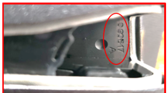
Example 7-digit code