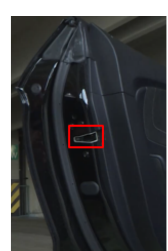
Above: Driver side door is pictured; passenger side door is similar

If you cannot read the code, be sure it is not obscured by dirt. If you still cannot read the code even after cleaning, be sure to note this in the website when you submit the results of your inspection.